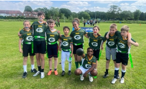
NFL Flag American Football

This week, we have taken part in a Netball Tournament, where the Netball team qualified for the quarter finals. An NFL tournament, which was an all day event at London Tigers, Southall; again we got through to the quarter finals. We are really proud of all our teams. Our Netball Team were one of the top 8 in the borough! Well done! Last week the tag rugby team took on many local schools at a tournament hosted by Chase Bridge where they played extremely well.