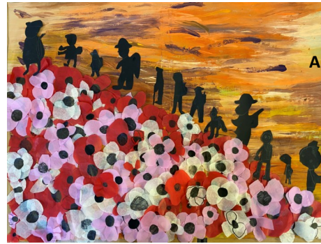
Art Work By Year 3

This week, Year 6 pupils have, as usual, been selling poppies on behalf of the British Legion. In their classrooms and in assembly, all children have been reflecting in a variety of ways on the significance of Remembrance Day and why we commemorate those who lost their lives in conflict. For a full list of events at a national level and for more information about Remembrance, you may find the following link useful: https://www.britishlegion.org.uk/get-involved/remembrance .