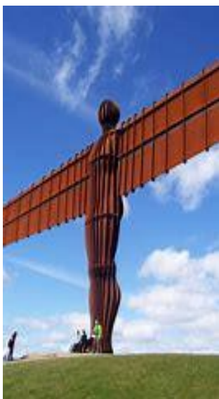
Landmarks of the United Kingdom

The United Kingdom is made up of England, Wales, Scotland and Northern Ireland. Wales, Scotland and Northern Ireland also have their own capital cities The capital city of England is London and it is also the capital of the United Kingdom. It is a global city and financial centre with a population of 10.3 million. Parliament is the place where laws of the land are made and debated. The laws govern the whole of the United Kingdom. In the 1990's Scotland, Wales and Ireland voted to have the right to make decisions about their countries on local issues. The monarch, Queen Elizabeth II , has reigned since 1952. Boris Johnson is the Prime Minister under a Conservative government. The United Kingdom is surrounded by the North Sea, the Irish Sea, Celtic Sea and the English Channel. Twickenham is a suburb on the outskirts of London and is where you would find Whitton. Twickenham is home to the Rugby National Team and the stadium is in walking distance to Nelson School. By the end of this period of learning , the children should be able to name the countries in the United Kingdom and their capital cities and find Great Britain on a map. They should also name some of the physical and human features which are well-known. Explain some of the traditions that represent the countries of the United Kingdom. Name the national flower of each country of the United Kingdom.