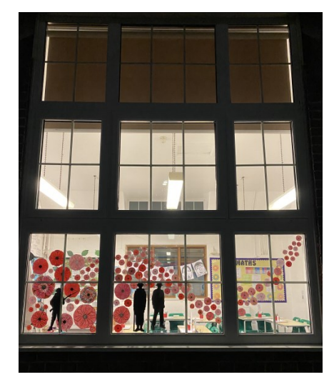
6N made a lovely poppy display in their window